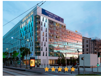
NOVOTEL SUITES CENTRE EUROMED