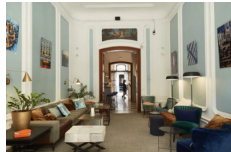
MAISON MONTGRAND VIEUX-PORT