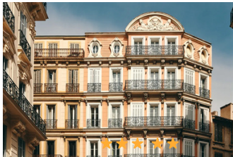
MAISON SAINT-LOUIS VIEUX-PORT