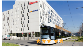
IBIS SUITES CENTRE EUROMED