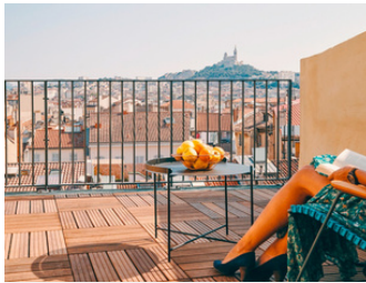
MERCURE CANEBIÈRE VIEUX-PORT