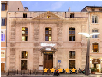
IBIS BUDGET VIEUX-PORT