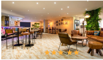
MERCURE CENTRE VIEUX PORT